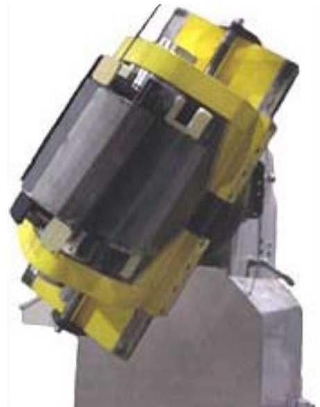
ASSEMBLY MOUNTED ON WINDING MACHINE

P.O. BOX 157 113 STILL RIVER ROAD BOLTON, MA 01740-0157 USA P: 1-978-779-6600 F: 1-978-779-2954 E: info@broomfieldusa.com