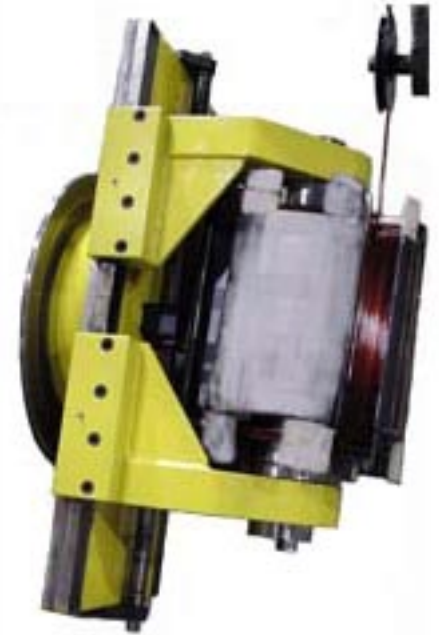
SALIENT POLE ROTOR MOUNTED IN TOOLING