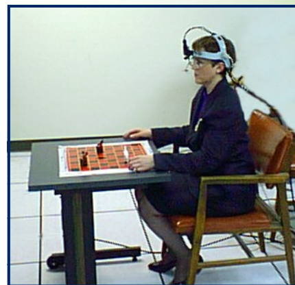
H6 EYEHEAD™ package data

When combined H6 optics with an optional head tracking device and ASL's EYEHEAD™ software package, participant's gaze with respect to stationary surfaces in the environment is provided. Recorded EYEHEAD™ data files report the identification number of the surface being viewed, point-of-