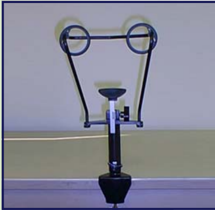
© Model 819-2150 Table/ Forehead Chinrest